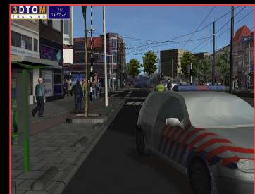
Crime Scene Management