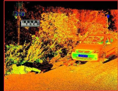
Crime Scene Analysis

www.4n6solutions.com enquiries@4n6solutions.com +44 (0)1423 564808